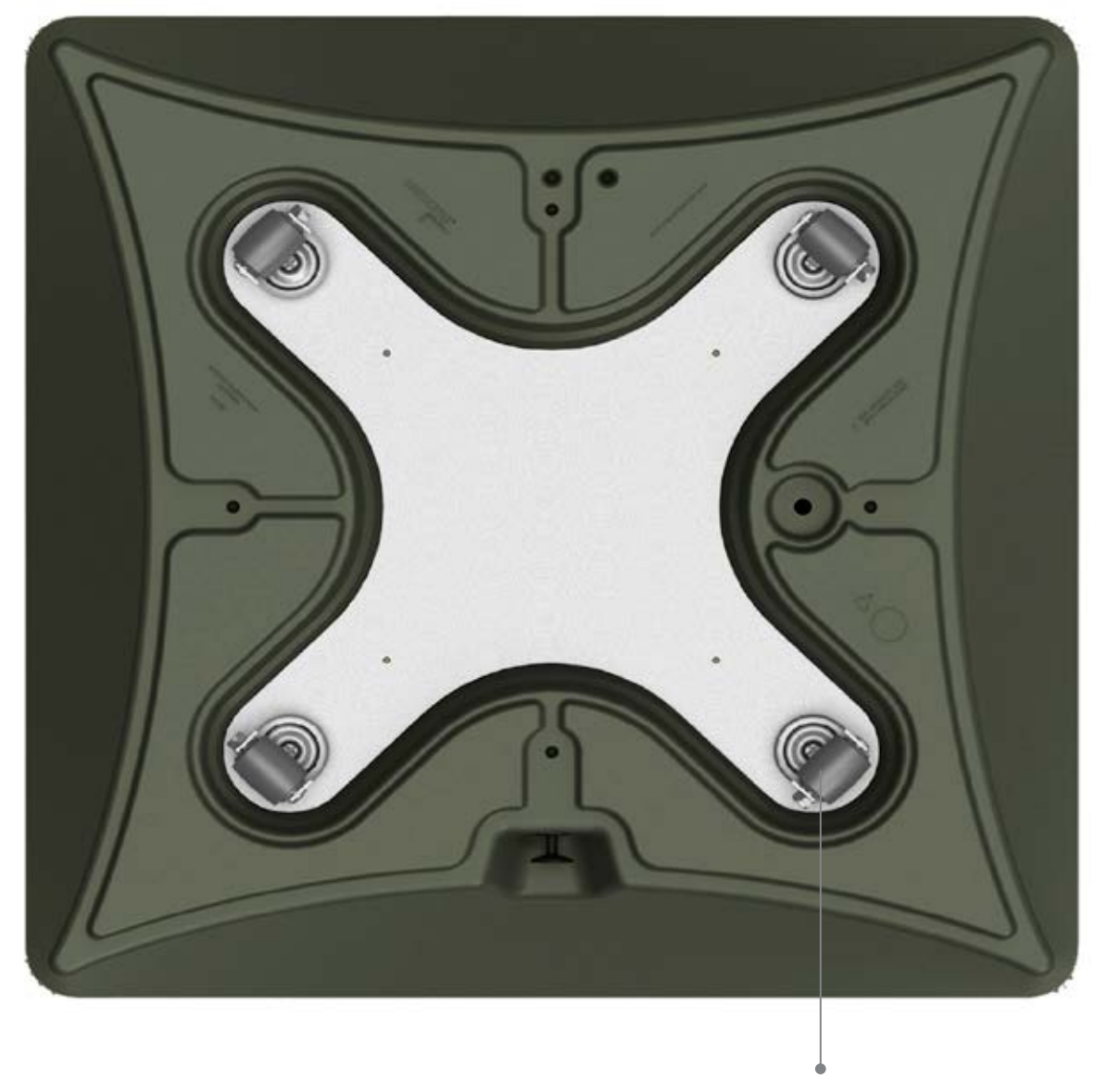
Rotating, recessed caster base can be added for mobility.